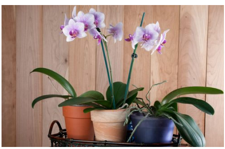
The Speedy Switch - 6 Ways to Streamline the Move Out Process