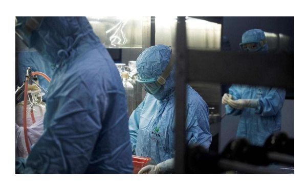
Researchers are probing whether the prostate cancer drug Veyonda could help reduce inflammation and protect against organ failure in coronavirus cases.

Researchers from the Hudson Institute of Medical Research in Clayton have been probing whether the prostate cancer drug Veyonda could help reduce inflammation and protect against organ failure in coronavirus cases.