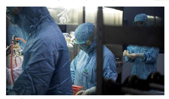
Researchers are probing whether the prostate cancer drug Veyonda could help reduce inflammation and protect against organ failure in coronavirus cases.

Researchers from the Hudson Institute of Medical Research in Clayton have been probing whether the prostate cancer drug Veyonda could help reduce inflammation and protect against organ failure in coronavirus cases.