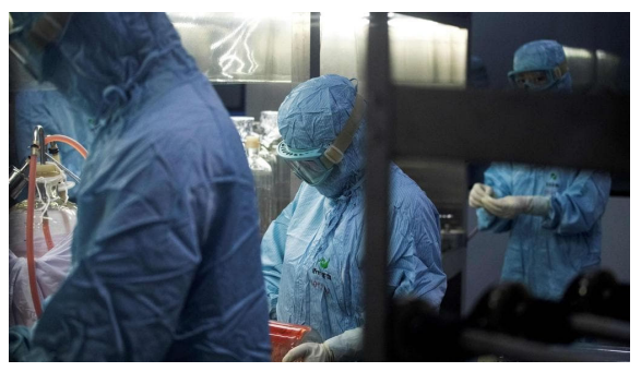
C Researchers are probing whether the prostate cancer drug Veyonda could help reduce inflammation and protect against organ failure in coronavirus cases.

Researchers from the Hudson Institute of Medical Research in Clayton have been probing whether the prostate cancer drug Veyonda could help reduce inflammation and protect against organ failure in <u>coronavirus cases</u>.