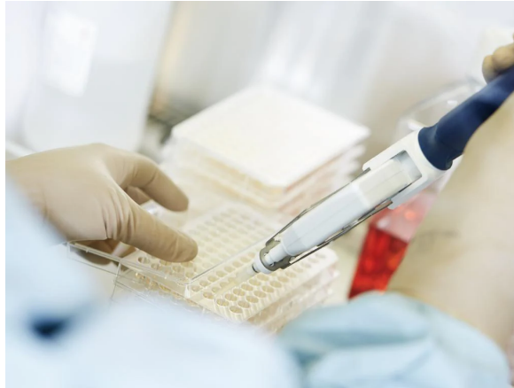
There are more than 50 vaccines underway in Australia alone.

The Kirby Institute at UNSW Sydney is researching hyperimmune globulin-based therapy based on the blood plasma of people who have recovered from the virus, it is engineering monoclonal antibodies for COVID-19 protection and therapy and is working on a treatment that could be delivered direct to the lungs via an inhaler or puffer.