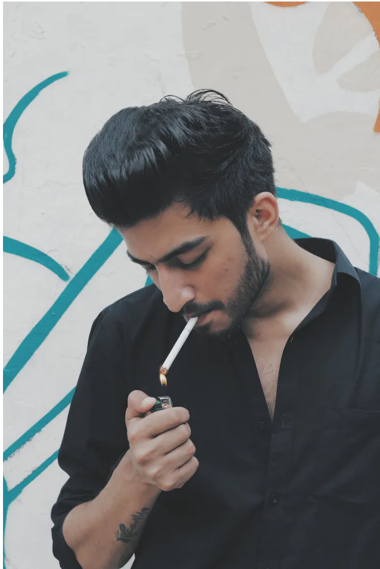
Smoking affects sperm quantity, shape and motility.

There is no safe limit for smoking – the only way to protect yourself and your unborn baby from harm is to quit. The good news is the effects of smoking on sperm and fertility are reversible, and quitting will increase the chance of conceiving and having a healthy baby.